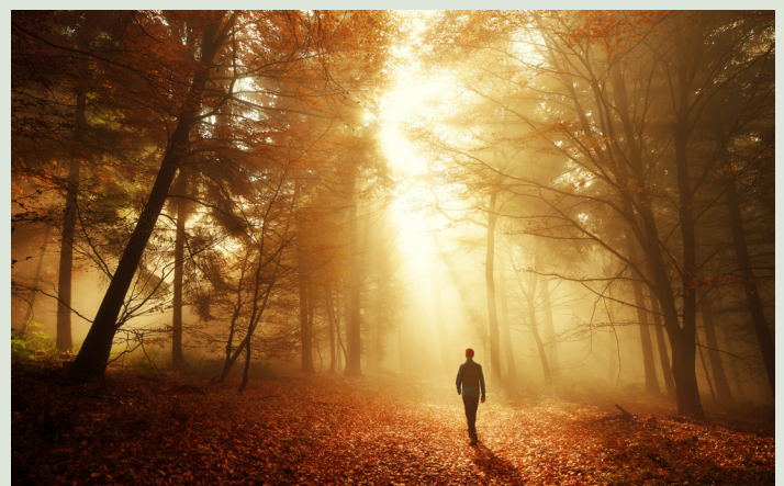
Forest bathing can help decrease stress, blood pressure, and heart rate.