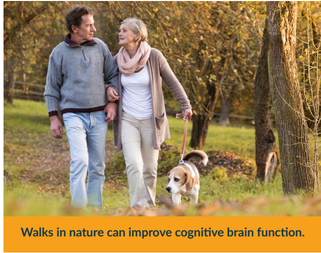
Walks in nature can improve cognitive brain function.

Contact with nature can also provide relief, and perhaps healing, for those who suffer from short-term and chronic mental illness (Berman and others 2012), including depression, anxiety, and mood disorders.