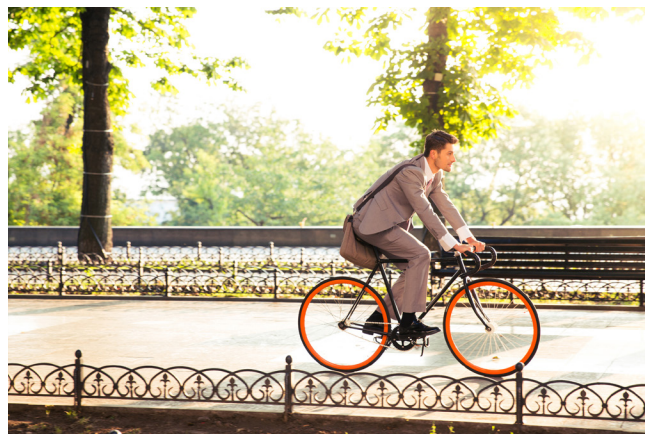
Fewer people bike to work than in the past.

The shift to a sedentary lifestyle has been rapid and costly. Though it's been shown that changes in diet can