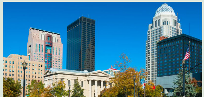
The interdisciplinary Green Heart Study in Louisville, KY, is looking at the effects of neighborhood greening.

Most of the research reported here explores health outcomes from visual stimulus; scientific investigations are now exploring the influence of other sensory inputs—sound, smell, ambient temperature, and body sensation—on health response. And while less prominent across the decades, qualitative studies of place, meaning, and social interactions continue to reveal human’s need to connect with nature for our health and wellness.