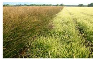
NATIVE GRASS BANDS