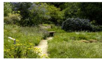
NATIVE GRASS & SEDGES