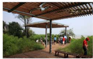
ENTRY PLAZA ARBOR