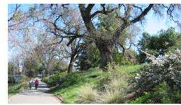
MATURE RIPARIAN TREES