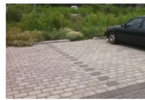
PERMEABLE PAVER PARKING