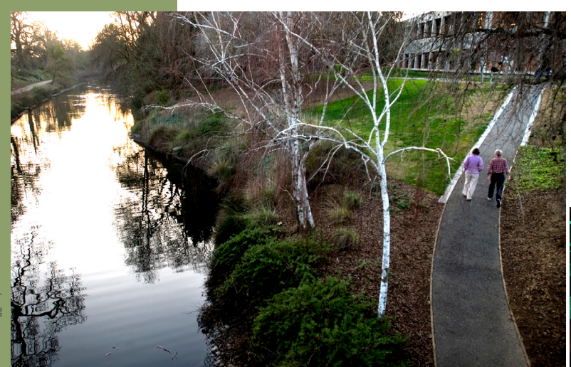
Winter walkers in the Arboretum; toyon berries brighten the winter garden.

At the UC Davis Arboretum it sometimes seems there are only two seasons—blasting, hot summer or gray, damp winter. The marvelous mild and clear days of fall are all too brief and quickly give way to the central California version of winter, when the cold fog hides the sun and chills our toes.