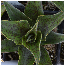
mangave x Mangave cvs. (Mad About Mangave® Collection)

This is your next must-have, summer-blooming perennial. This coneflower grows to 24" tall and clumping. 'Ruby Giant' surpasses expectations as a result of its natural, vigorous habit and non-flopping stems that hold 5", fragrant, ruby-pink flowers that look great in arrangements. Try 'Ruby Giant' in a hot, dry spot with poor soil to attract numerous bees and butterflies. Allow the spent blooms to stay until the song birds have a chance to eat the seeds.