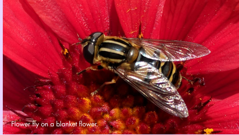
Flower fly on a blanket flower.

Although they are generally known to visit weedy plants like alyssum, mustard, and thistles, several species visit common drought-tolerant plants throughout the Arboretum and Public Garden. You can find several of these plants at our fall plant sales, including blue-eyed grass ( Sisyrinchium bellum ), blanket flowers ( Gaillardia cultivars), butterfly rose ( Rosa x odorata 'Mutabilis'), and Wayne Roderick seaside daisy ( Erigeron 'W.R.').