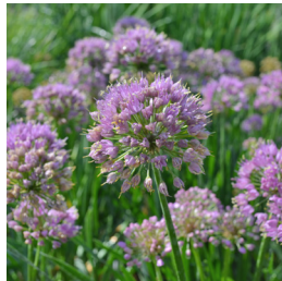
flowering onion Allium 'Millenium' (yes, only one "n")