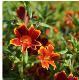
monkey flower Mimulus cvs. (Jelly Bean™ Series)

Ok, this is more than one plant, but once you see them, you'll understand. A genus cross between patterned Manfreda foliage with the habit and tolerances of Agave give way to a stunning and unique new plant for your garden. Easily fits into nearly every potential place in your yard. Pots? No Problem. Bright shade under trees? Easy. Full sun? Bring it on. This cold-hardy collection has year-round color and interest, and there are several distinctive cultivars to try.