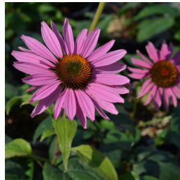
coneflower Echinacea purpurea 'Ruby Giant'

What a rock star! Here's a super drought-tolerant flowering bulb that brightens up any sunny garden. This 2018 Perennial Plant Association "Plant of the Year" has also stolen our hearts with its large, spherical orchid-purple flowers, tidy, low-maintenance appearance and low-water needs. Pollinators and beneficial insects visit colorful blooms all summer long. Growing only to 16" tall, 'Millenium' can find a home in any sunny landscape.