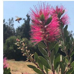
bottlebrush Callistemon 'Neon Pink' Bottle Pop™

Here's another fantastic new series for the horticulture world, and it's impossible to pick just one. If you've been trying to establish a California native monkey flower in your yard without success, try once more. They are bushier, come in diverse colors and offer an extended bloom season. They are heat and drought-tolerant, easy-maintenance plants that attract hummingbirds and pollinators throughout the year. Plant in full sun to bright shade and enjoy.