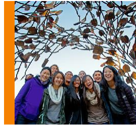
Arboretum GATEway Garden

Enjoy our newly-renovated Arboretum Waterway and explore native plant gardens that celebrate our local natural and cultural heritage.