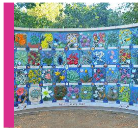
Nature's Gallery Court