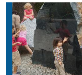
California Rock Garden