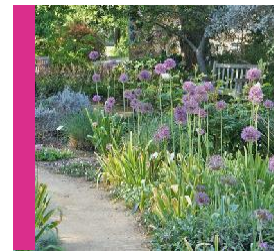
Ruth Risdon Storer Garden