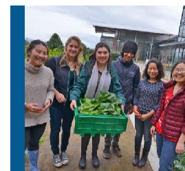
Good Life Garden

Explore the diverse academic work of UC Davis in our GATEway gardens. These landscapes were co-created with faculty and students in multiple campus departments.